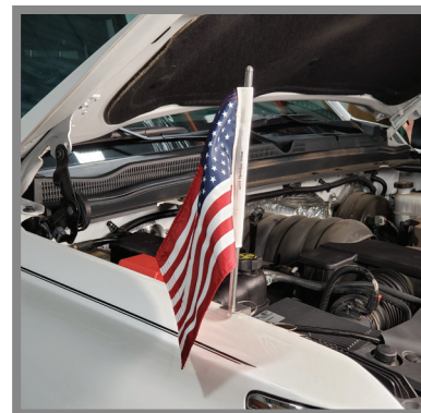
Install flag and close hood.