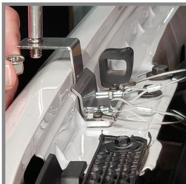
Place flagstaff into mounting hole and screw to secure.