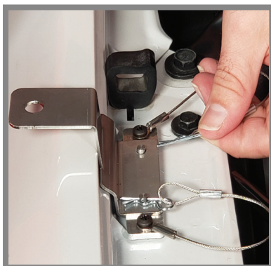
Secure bracket with retaining pins.