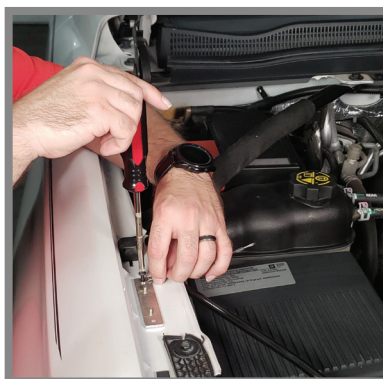
Secure the mounting base to the inner fender.